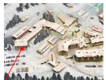
ACCREDITING OFFICE 1.floor